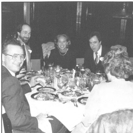
One of many convivial tables.