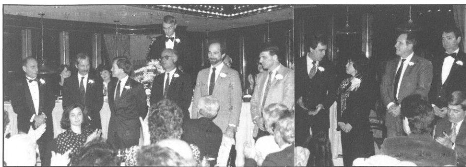
Saluting the old, welcoming the new...1988 officers are formally installed.