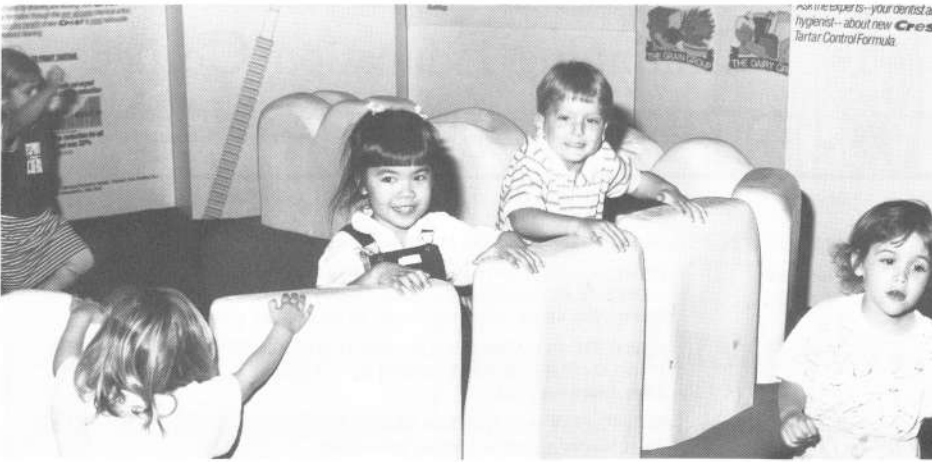
Here are teeth you can climb on.