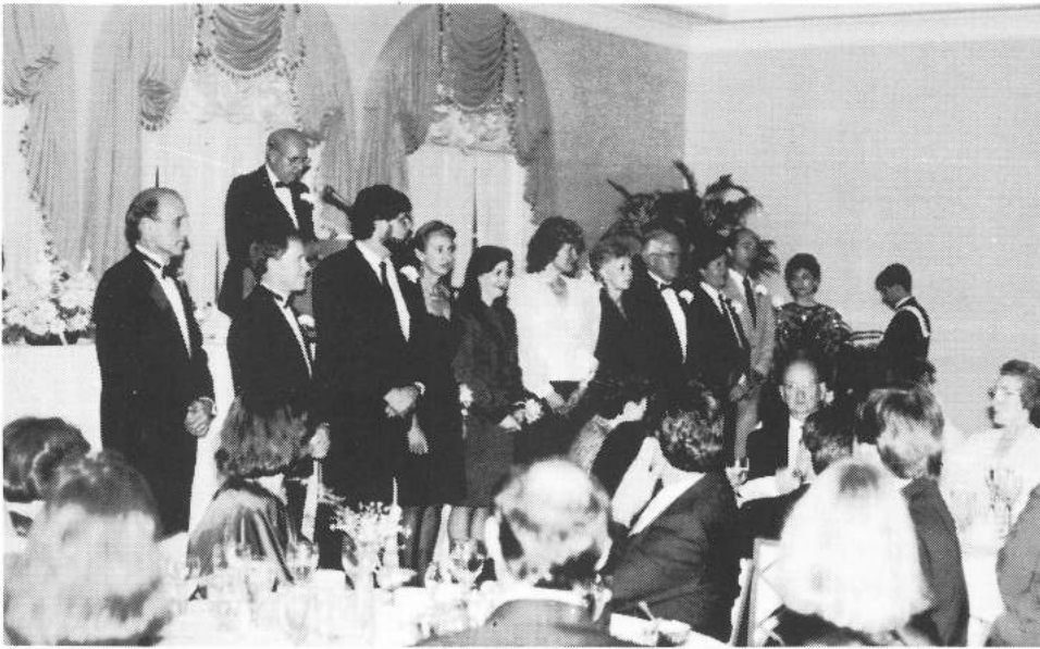
Officers, Board of Governors are officially installed at English Turn dinner.