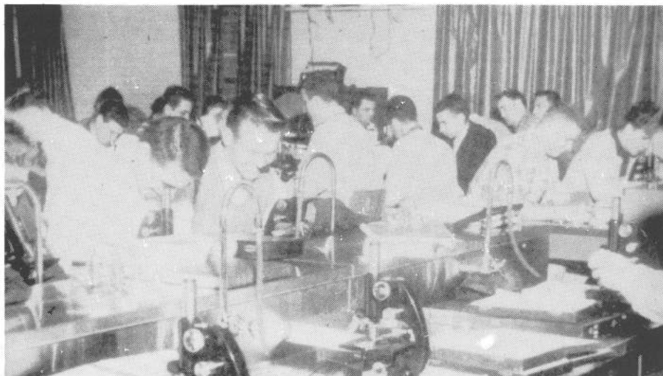
The year is 1959. This is the Biever Hall lab for histology and pathology at the Loyola Dental School. Recognize anybody?