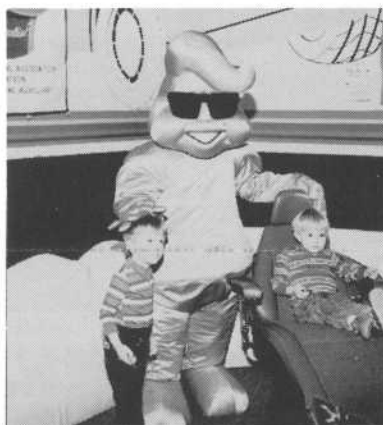
Procter and Gamble's Mr. Sparkle greets youngsters.