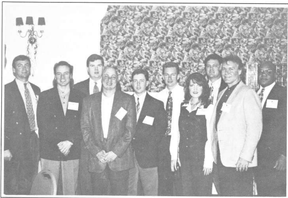
WELCOME, COLLEAGUES: A large contingent of young dentists attended the annual New Member Dinner February 18 at Carlone's Restaurant. Nearly 40 new members joined the ranks of the New Orleans Dental Association during the year.