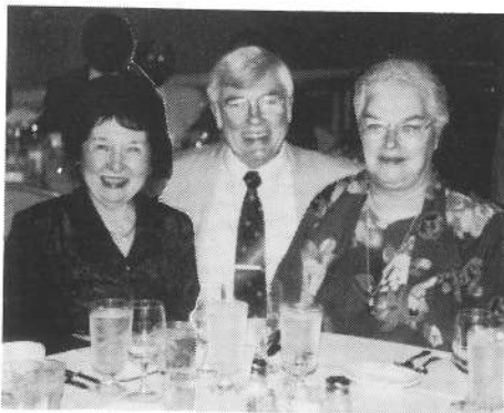
Trio pauses for photographer. The event was at the Metairie Country Club.