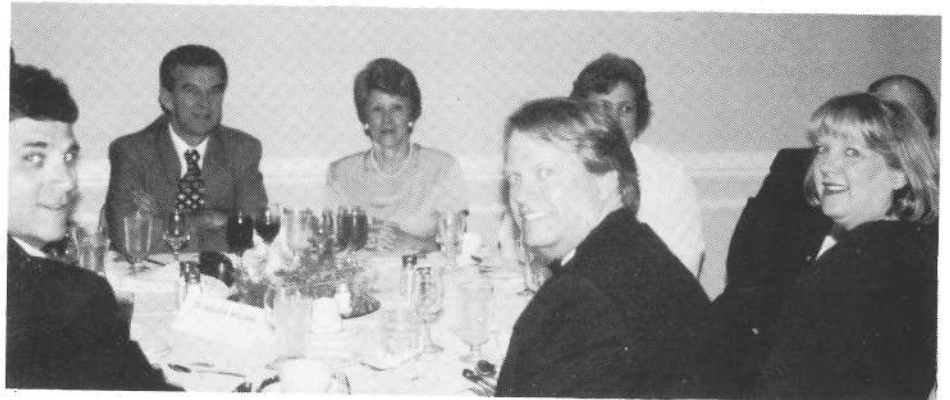
Conference Committee members were out in force.