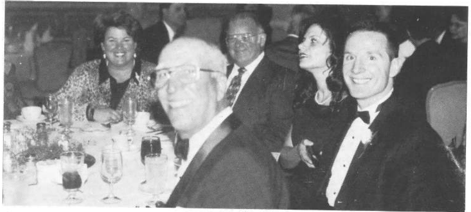
A happy table. Approximately 120 members and guests attended.