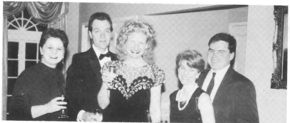
Getting together with friends at pre-dinner reception