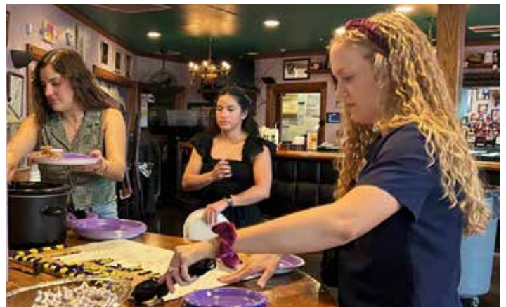
LSUSD Senior 2024 Crawfish Boil – Southport Hall