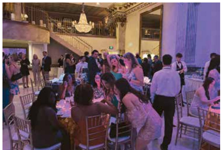
LSUSD 2024 Seniors Party The Balcony