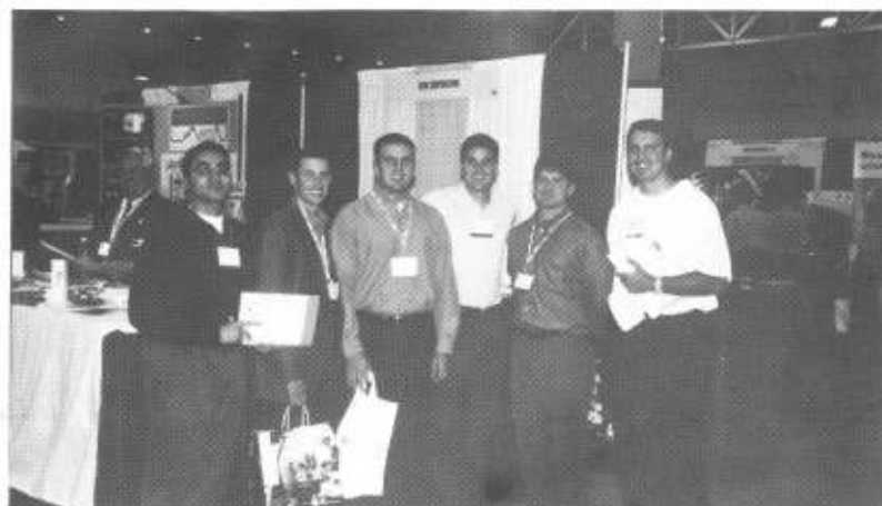
A break between sessions.