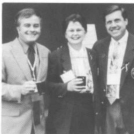
Busy people take a break.

Photos by Dr. Kristi Solleau and Dr. Tom Giacona