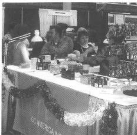
Only three exhibitors cancelled.