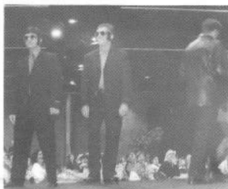
Can they be the "Blues Boys?"