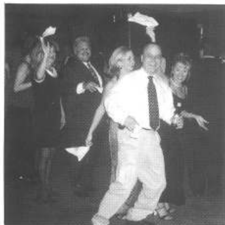
There's always a "second line."