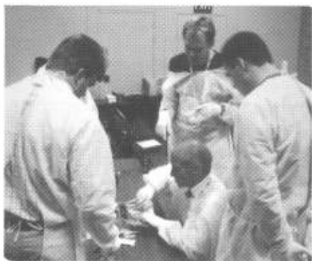
One of several workshops.