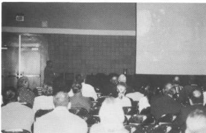
Business first, then fun.