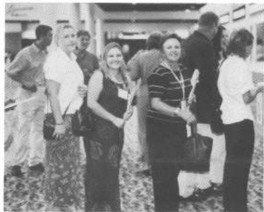
The lines moved fast.