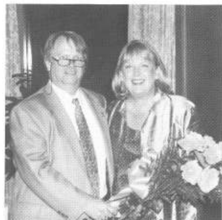
Honoring the chairman's Mrs.