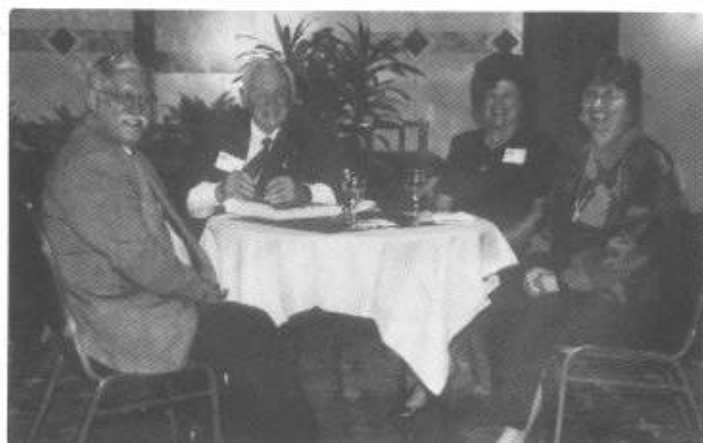
Meeting friends, classmates.