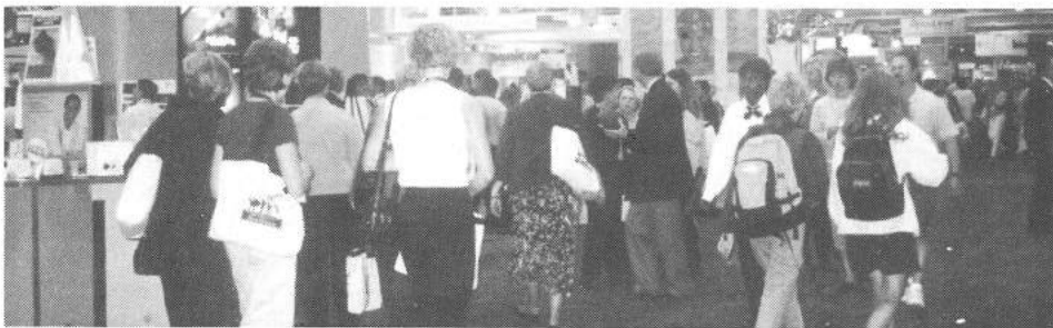
Attendees throng exhibit hall between sessions.