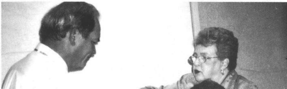
NODA representatives assist registrants. Over 400 locals assisted.