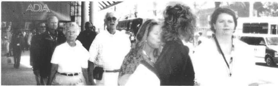
Visitors head for a New Orleans lunch.