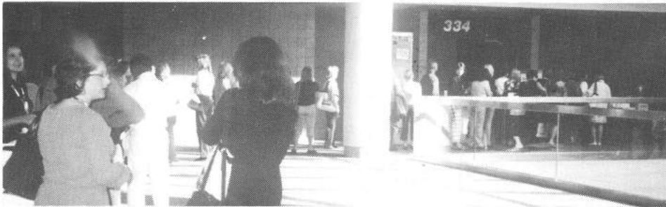
Long lines awaited many of the sessions.