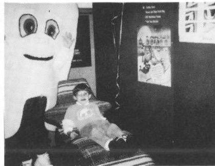
Who's afraid of a dental chair? Not while Happy Tooth is around! The Louisiana Children's Museum was jammed with eager youngsters.

Arrangements were made for dentists to appear on TV and radio programs.