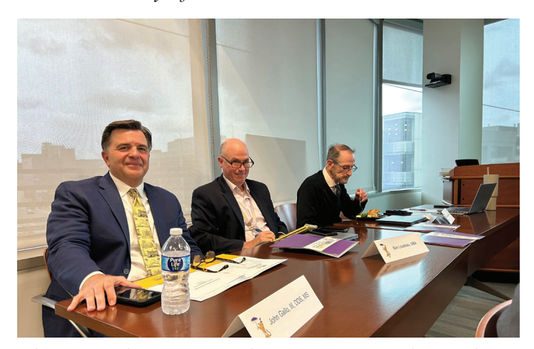
The Foundation provides support and academic fundraising to the six professional schools & eight Centers of Excellence that make up LSU Health New Orleans.