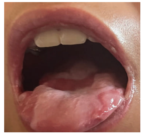
Figure #3 (RIME – Tongue) Same patient 3 weeks later with remaining lesion on tongue, although labial lesions had healed.

'RIME' is a relatively new term that was initially designated strictly to the category of MIRM (Mycoplasma-induced rash and mucositis), given that all thenrecognized cases were respiratory, typically associated with M pneumoniae(4). In 2018, however, (Continued on page 12)