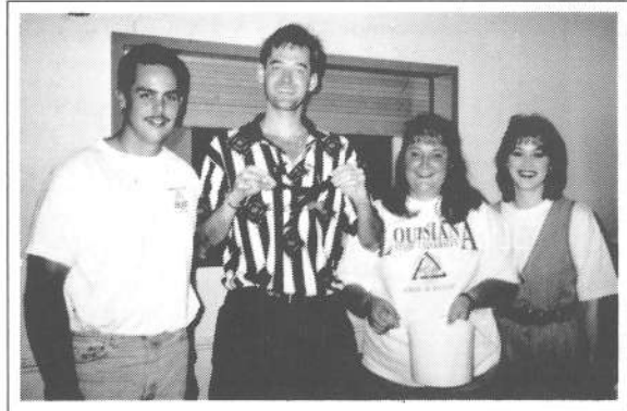
LSUSD students were a big help as servers.