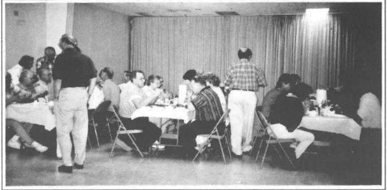
Some real crawfish aficionados in this group.